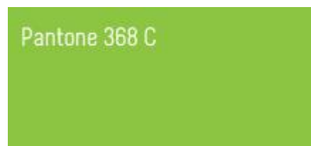
Pantone 368 C