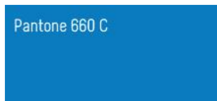
Pantone 660 C

The logo colours can be achieved by using the Pantone colour references or by four-colour process: