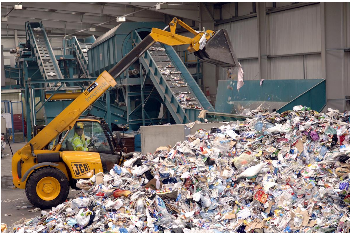
Recyclate sorting at a Materials Recovery Facility.